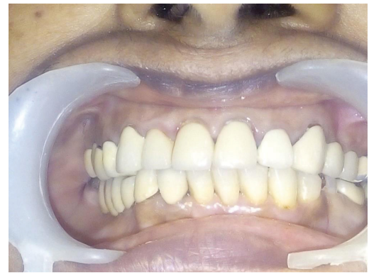
Figure 8: Front view of Richmond crown in relation to upper left lateral incisor.

Post and core treatment has been successfully practiced since ages [3]. Alternative procedure needed to obtain remaining crown structure so as to manage arc of rotation under oblique forces (function) such as crown lengthening procedure or forceful orthodontic extrusion. Many causes of failure of post and core retained restorations have been identified, including: recurrent caries, endodontic failure, periodontal disease, post dislodgement, cement failure, post-core separation, crown-core separation, loss of post retention, core fracture, loss of crown retention, post distortion, post fracture, tooth fracture, and root fracture. Also, corrosion of metallic posts also has been proposed as causes of fracture [4-6].