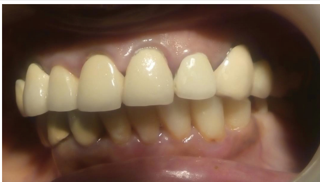
Figure 7: Side view after restoration of upper left lateral incisor with Richmond crown.