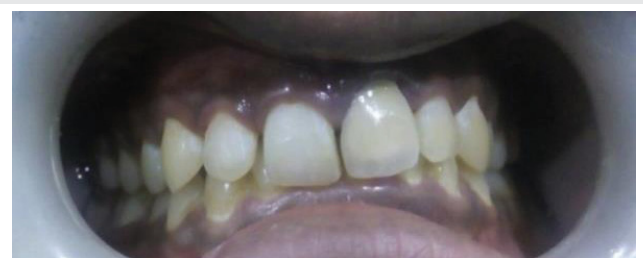
Figure 5: Placement of crown with upper left central incisor.