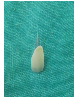
Figure 2: Facial surface of Richmond crown.

Final crown is placed in position and occlusion correction was made. High points were recorded and corrected. Final cementation was done with Type I glass ionomer cement (GC, Japan) (Figures 4,5).