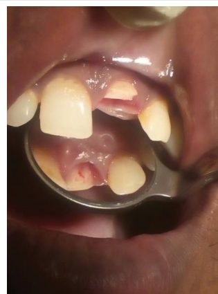
Figure 1: Fracture of upper left central incisor with open pulpal chamber.

Clinical examination showed that he got fractured upper