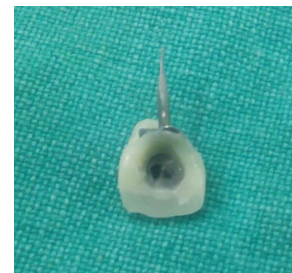
Figure 3: Palatal surface of Richmond crown.