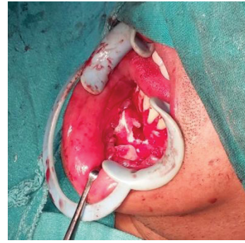
Figure 2: Exposure of the surgical site.