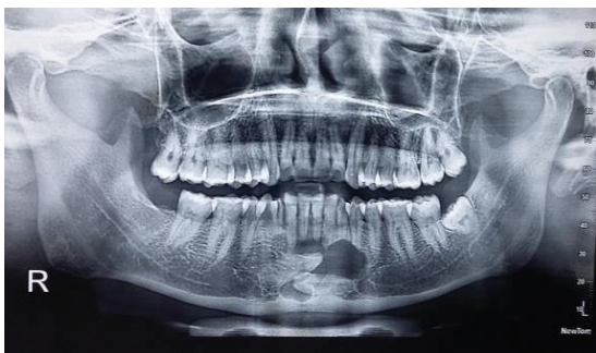
Figure 1: Orthopantomograph showing transmigrated kissing canines 43 and 33 with unilocular radiolucency suggestive of cystic changes.

Usually transmigrated mandibular canines are asymptomatic. These can be suspected in absence of permanent canines from the arch or the presence of over-retained primary canines and thus can be confirmed by intraoral and panoramic radiographs. Sometimes they can be associated with swelling in the vestibule due to cystic changes as was present in our case. Dentigerous cyst is the most commonly associated cyst