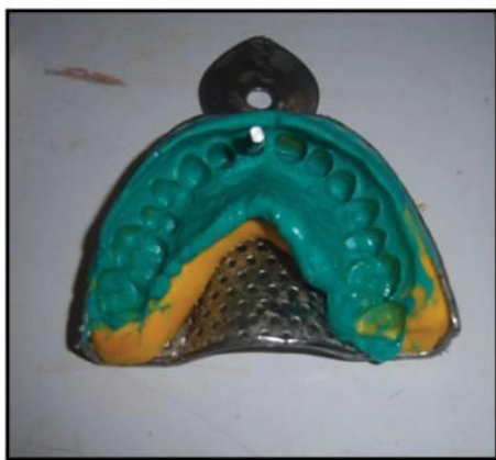
Figure 8: Closed tray impression with abutment and analogue.