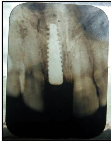
Figure 6: Post-operative Radiograph showing implant # 21.

placed and left for 1 week for soft tissue recontouring (Figure 7). Closed tray transfer with indirect transfer coping was used to make impression with polyvinylsiloxane (Figure 8). Abutment was milled and verified in patient's mouth. Shade selection was done and final prosthesis was cemented with non-eugenol cement (Figure 9). Patient recalled regularly after one week, one month and six month interval to evaluate the situation and was found normal. The prosthesis was well in function up to the final evaluation. Follow up was continued till 2 years. The soft tissue health and width of the ridge was well maintained with good esthetic result.