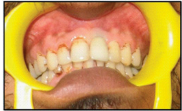
Figure 9: Final prosthesis delivered # 21.