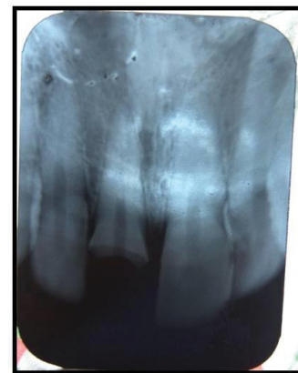
Figure 4: Atraumatic Extraction of root stump # 21.