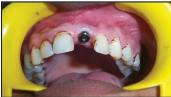
Figure 7: Gingival former placed in second stage surgery.