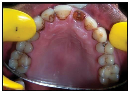
Figure 1: Fractured root stump in relation to left central incisor.

Immediately before the procedure, patient was asked to rinse his mouth for 2 minutes with a 0.12% chlorhexidine digluconate solution. Following an injection of 2% lignocaine with 1:80,000 epinephrine local anesthetic (Lignospan Special, Septodont), atraumatic extraction of the remaining root portion was done with the help of periosteal elevator (Figure 4). The extraction socket was thoroughly debrided and degranulated. Implant desired position was located with surgical template and sequential drilling was performed, following this implant was placed with insertion torque of 40 Ncm (Figure 5a,b). After hand-tightening, marginal gap voids about 2-3 mm in width were noted between implant surface and the buccal cortex. The marginal voids were grafted with deproteinized bovine bone (Bio-Oss, Geistlich A G, Wolhusen, Switzerland), the flap was repositioned and the wound was closed by means of single sutures (Figure 6). Immediate temporization was done with acrylic tooth, which was splinted with the adjacent teeth with fiber-bond splint. The patient was placed on amoxicillin 500mg thrice daily for 5 days, mefenamic acid 500mg initially, then 250mg four times a day for 5 days and asked to do gargle