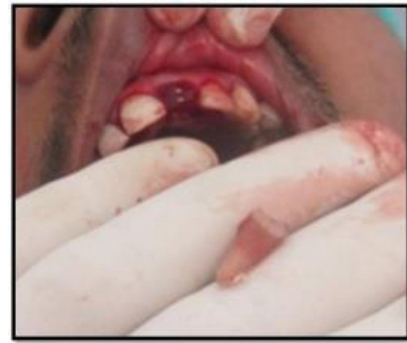
Figure 3: Diagnostic Radiograph #21.