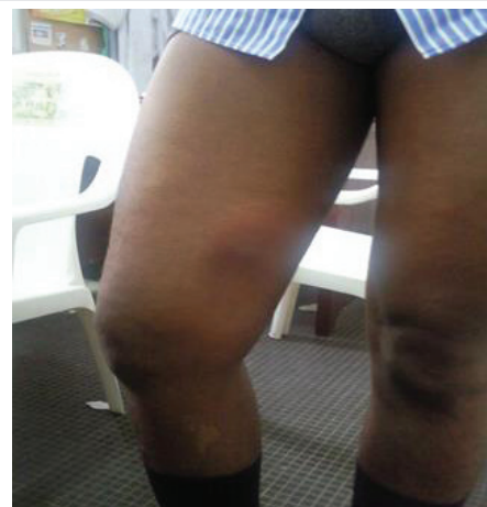
Figure 1: Thigh Swelling.

distal third of the thigh with a painful limitation of the knee joint amplitudes (Figure 1). Elsewhere, the patient was afebrile with a good general condition and the rest of the examination was unremarkable. The biological assessment showed a