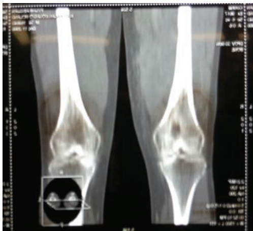
Figure 2: CT scan Metaphyseal gap.

slight increase in SV and CRP without hyperleukocytosis. The standard radiographic workup, followed by CT scan, revealed a lacunar metaphyseal image of the distal femur delimited by a thick, sharply contoured osteocondensation (Figures 2,3). This radiological aspect led us to make the diagnosis of either a bone tumour or a Brodie's abscess. Surgery was therefore performed. The approach was centered on the swelling on the inner side of the distal third of the thigh. We found approximately 300cc of pus extending from the soft tissue to the bone gap. After removal of the pus and washing with saline, we proceeded to curettage and excision of the osteitis (Figure 4). Samples were taken for bacteriological and pathological examination. Suturing of the incision was done on a suction drain.