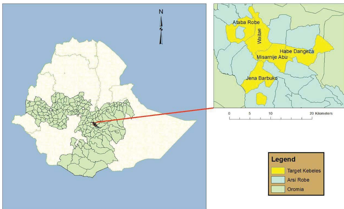
Figure 1: Map of the study district.

In collaboration with agricultural office expert the site as well as the farmers were selected, then after the orientation regarding cluster formation were given for experts,