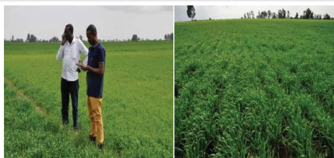
Figure 2: When Expert & researcher at wheat field monitoring and evaluation time (left) & visited bread wheat field at (right).

The agricultural extension gap analysis indicate that there is a wide difference among all varieties in their average yield gap and yield performance between this demonstration at farmers field and the potential of the varieties at research field,