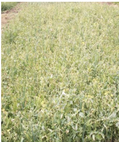
Figure 1: Garlic plot before Mogfeen240EC application.