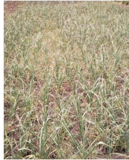
Figure 2: Garlic plot after Mogfeen 240EC application.