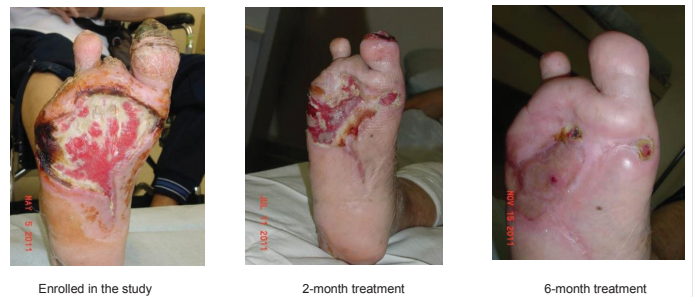
Figure 3: A 48-year old man with a right sole diabetic foot ulcer, existing already for 25 months, not responding to classic wound treatment.

Note: W_area_gp: Wound size; Ulcer_dur_group: Ulcer duration before entered the study; Ulcer_Group: Wound type