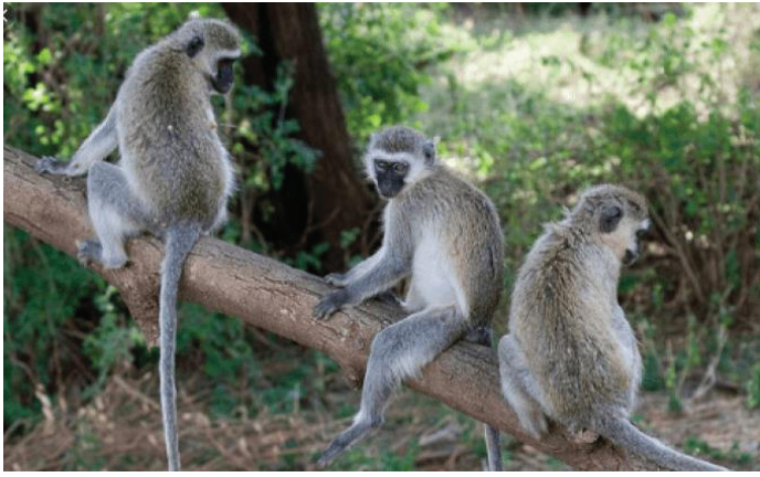
Figure 2: Monkeys in agricultural lands: Source /KNA [14].

of sandy, loamy soils and patches of black cotton soils, stony and rocky soils, and hilly terrain with busy Acacia / Commiphora vegetation and sparse human population on the lowlands and hills sides of the habitats [5]. Further, it has riverine vegetation along the seasonal Tiva and Mwitasyano rivers that transverses on the eastern and western sides of Kwa Vonza/Yatta ward respectively. This forms a suitable habitat for wild animals, like snakes, monkeys, guinea fowls, dik-diks, etc. These wild animals are bound to destroy crops, attack livestock, injure humans and create fear among the residents of Kwa Vonza/Yatta ward in Kitui Rural Constituency.