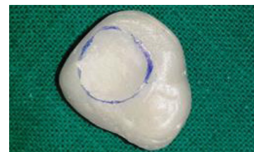
Figure 6: Vaulted ocular prosthesis.

The prosthesis after the final vaulting was finished, polished and delivered to the patient (Figure 7). In order to prevent subsequent marginal inflammation, the vaulted ocular prosthesis did not make any contact at the area of implant exposure and hence reducing uneventfully chances of further implant exposure. A stock conformer was placed along with instructions to apply dexamethasone (Ocupol-D) ointment three to four times daily for a period of 6 weeks, to decrease the inflammation. Stock conformers are usually a thin shell of acrylic resin with concavity on the tissue surface of the conformer, which does not contact the exposed implant site.