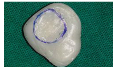
Figure 5: Area of implant exposure marked on the tissue surface of final prosthesis.