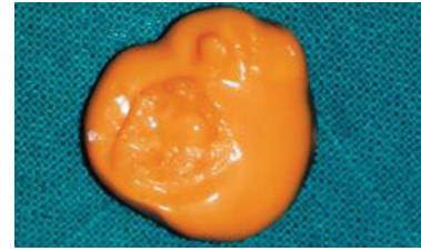
Figure 3: Ocular impression using low viscosity silicone.