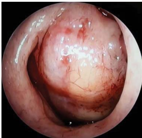
Figure 2: Cyst causing nasal obstruction.

Asymptomatic small cysts require no treatment. If the lesion is large, symptomatic or close to the Eustachian tube torus, surgical marsupialization under general anesthesia is the treatment of choice. Drainage alone can lead to recurrence. Endonasal approach with 0 degree rigid endoscope is recommended for small cysts, while for large lesions the transoral retrovelar approach using a 70 degree endoscope is preferred [6]. Surgery can be performed using cold instruments, powered instruments (microdebrider) or by laser technique (longer operation time and higher costs). The cyst must be drained and the aspirate sent for culture and antibiotic sensitivity (Figure 4). After complete drainage we resect the anterior wall of the cyst, without any damage on the prevertebralis muscles or fascia (Figure 5).