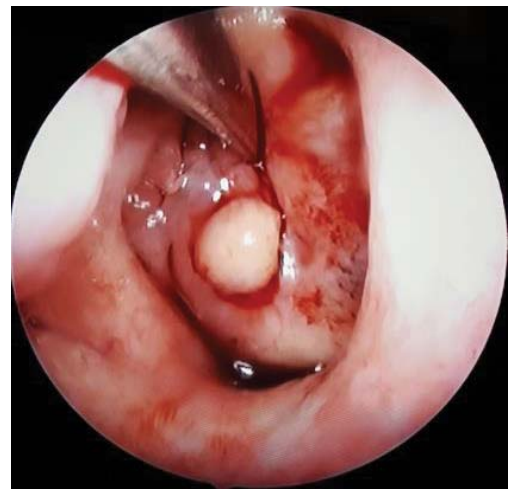
Figure 4: Drainage of the cyst.