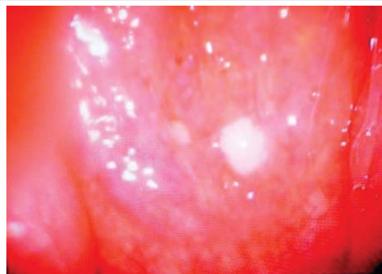
Figure 1: Small asymptomatic cyst.

Most Tornwaldt's cysts are small and asymptomatic, but they may develop symptoms as their volume increases due to mucous secretion. This happens either spontaneously or secondary to inflammation when edema of the orifice leads to further aggravation of the pathophysiological cycle (Figure 1).