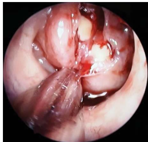
Figure 5: Resection of the cyst wall.

At the end of the procedure the surgical field is represented posteriorly by the prevertebral muscles, without any rhinopharyngeal obstruction and a normal nasal airflow. Marsupialization using a microdebrider is a fast method and provides less bleeding and less trauma on the surrounding tissues [7]. The cyst wall must be removed and sent for histopathological examination in order to confirm the diagnosis.