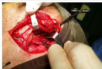
Figure 3: Intraoperative view before styloidectomy.

direction of the styloid process or calcification of its attached ligaments could lead to variable degrees of compression on these related important neurovascular structures expressing variable degrees of clinical symptoms ranging from no symptoms [15], or phantom foreign body sensation in throat to compressive cranial neuropathy most commonly presenting with odynophagia and radiating otalgia (classical type of eagle syndrome) or even compression over the internal carotid artery leading to pain in the parietal region of the skull or in the superior periorbital region or even cerebral ischemia (stylo-carotid type of eagle syndrome [6,16,17] (Figures 4,5).