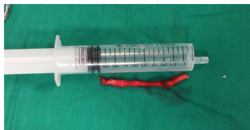
Figure 5: Gross appearance of the resected styloid and stylohyoid ligament.

method for confirmation of eagle's syndrome diagnosis [1,21,22], however, Eagle syndrome cases that result from stylopharyngeus muscle calcification may be missed by this type of imaging [5]. In our case, we believe that the length given by the radiologist is the combined length of the left styloid process and the calcified part of the stylohyoid ligament which was 6.7 on the left side.