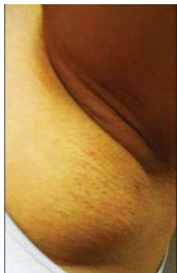
Figure 4: Clinical photograph of EBT in the left axilla on the 5th postpartum day.

feeding was soon established and the comfort of the patient was provided during hospitalization. The patient was advised regular follow-up by breast (examination and mammography), Our case was discharged on the postoperative 7th day and she was seen again after ten days, her complaints were much less as on the day of discharge (Figures 3,4).