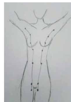
Figure 1: Breast Milk Line.

tissue, and may exhibit similar proliferative changes. Its prevalence in the general population is 2-6% [2,3] and can be seen in both sexes, mostly in Asian societies, however, two-