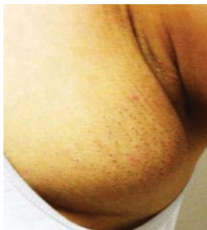
Figure 3: Clinical photograph of EBT in the left axilla on the 2nd postpartum day.

The patient was taken to analgesic and antibiotic treatment. No complication related to the operation was observed during the follow-up. The region where EBT is located on day 2 and 5 postpartum is given (Figures 3,4). She continued breastfeeding, pumping and nursing care plan for complaints. The swelling was slightly smaller (about half of initially observed) by the next days and from it no milk could be expressed through the skin. Finally, satisfactory breast-