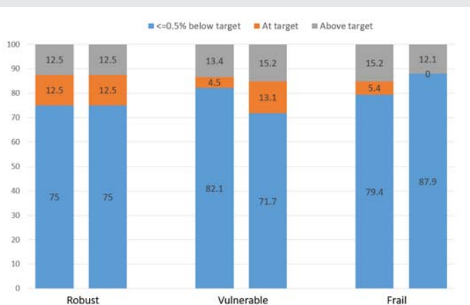
Figure 1: Percentage of patients with HbA1c more than 0.5% below target, at target or above target, across the health states (robust, vulnerable, frail) in the study by Deletre S et al (left hand bar of each health state) and in the study by Jacques A et al (right hand bar of each health state).